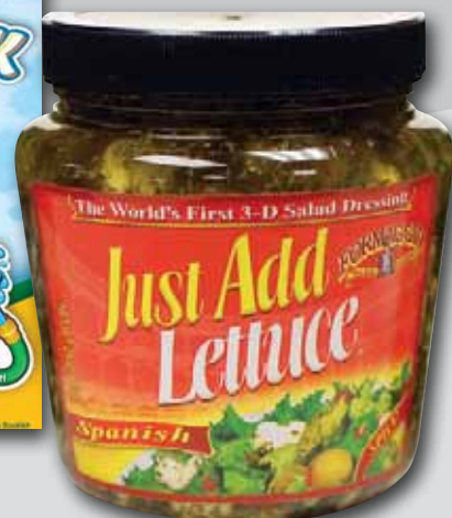
3D Salad Dressing